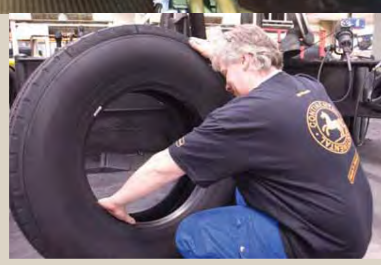
Final inspection before delivery. Every tyre will pass several checking stations

When using the cold retreading method a patterned and prevulcanised tread is applied to the buffed casing. This tread is placed under constant tension together with an unvulcanised bonding ply onto the buffed casing; pretensioning ensures that prior to vulcanisation that the tread adapts optimally to the tyre contour and guarantees that the parts are bonded together as best possible while the tyre is in the autoclave (curing chamber). Then the prepared tyre is 'packed' into a curing tube (envelope) and cured under pressure in the autoclave.