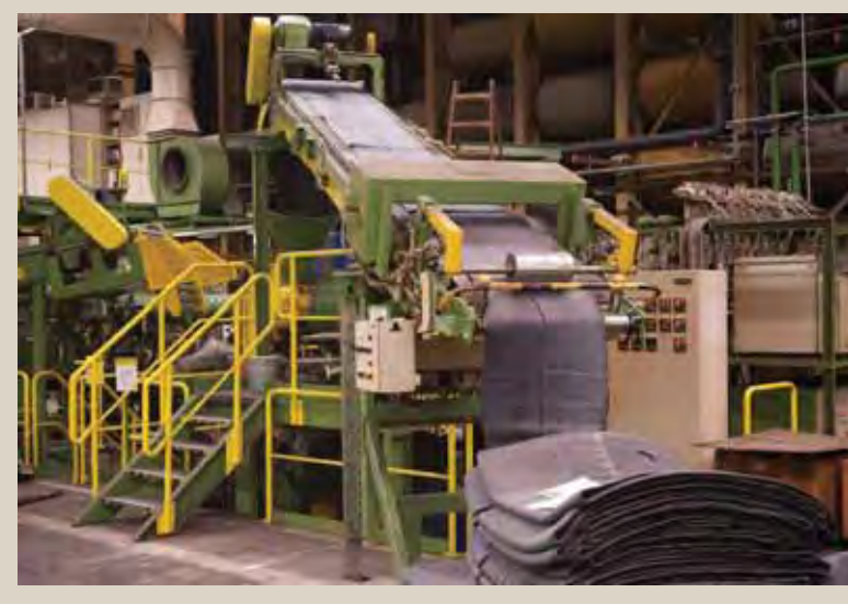
The various components of the tyre are being created from rubber mixtures, using extrusion

Two methods can be used for truck tyre retreading: hot retreading and cold retreading. Only carefully selected and properly inspected casings are employed for either of these methods. The manufacturing process itself is also identical for both methods, up to the point of applying the tread material and performing the vulcanisation.